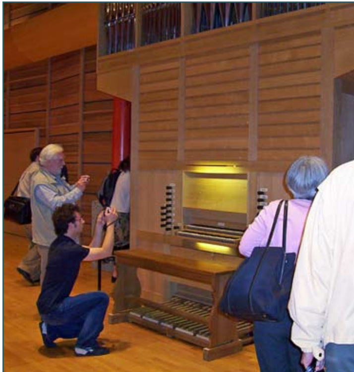
AMIS members get up close to the Ahrend organ at the University of Calgary

time, any desired musical expression should be reproducible, the performing technique should be somehow intuitive, and the technique should have a gestural coherence.