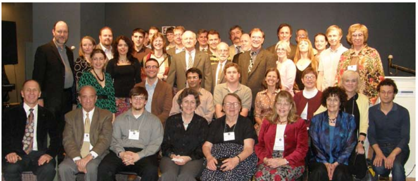
Group photo of Calgary attendees (A.H.)