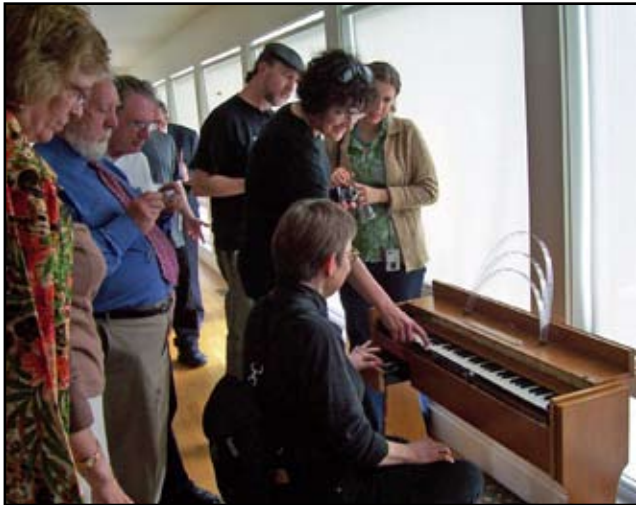
Trying out an Ondes Martinot at Audities Foundation