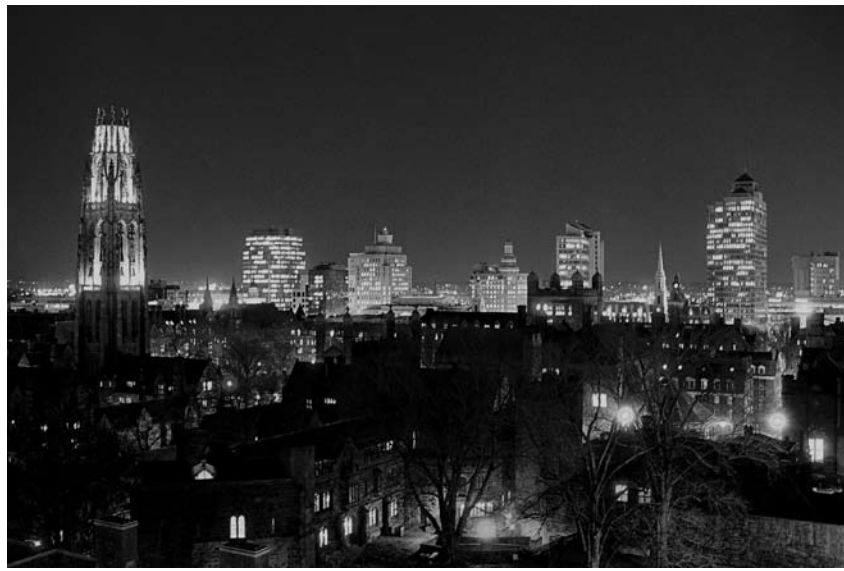
Yale campus at night.

As announced in earlier issues of the Newsletter, the thirty-sixth annual meeting of the Society will take place on the campus of Yale University in New Haven, Connecticut, from Wednesday, 27 June, through Sunday, 01 July 2007. The Program Committee is pleased to report that preparations are proceeding smoothly. Details about accommodations, travel, and the meeting's schedule appear below.