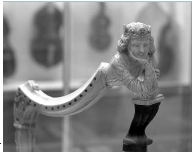
A Gothic revival ivory harp in the Yale Collection.