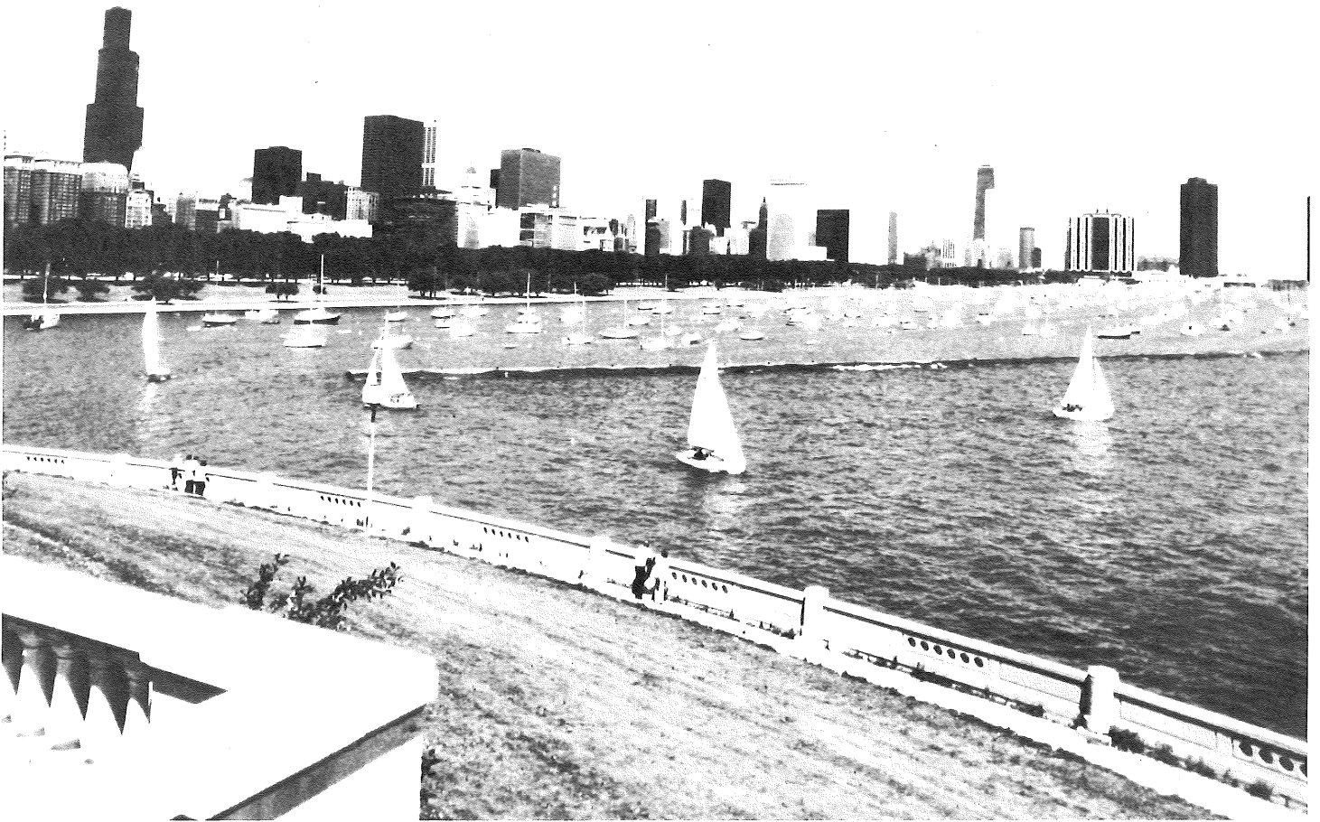
Largest fresh water port city in the world, Chicago boasts a magnificent skyline on one of the world's largest lakes, Lake Michigan. The tall building on the left is the Sears Tower, the world's highest.