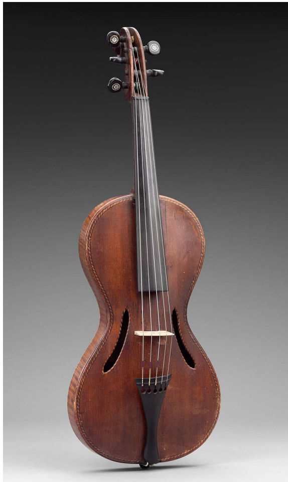
Figure 1: Museums of Fine Arts accession no. 2007.74.

Chanot / Paris 1817–1824 / W.S.G. It seems likely that W.S.G. stands for Walter Salon Goss (1853–about 1925), who operated a violin shop in Boston and might well have worked on this viola. He was