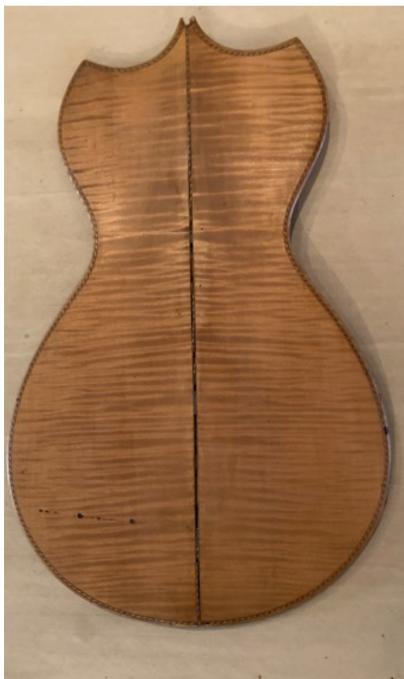
Figure 5: Guitar back, Matt Umanov Collection, New York, New York.

Living in Paris prior to 1840, he was likely aware of the similar violins produced by Chanot's shop, whose design was aimed at preserving the length of wood fibers in instruments as much as possible. Ragot may have subscribed to Chanot's acoustical theories, but it is equally possible that he simply liked the cornerless design from an aesthetic standpoint. But like Chanot violins, the instruments labeled by Ragot have ribs constructed from two continuous strips of maple, seamed at the center of the lower bout. The sound holes used are also similar to those on Chanot violins, but somewhat pointed rather than rounded at their ends. In Chanot's violins, the strings are fixed at their lower ends by wooden pins inserted into a hardwood plate glued directly to the belly, much like the