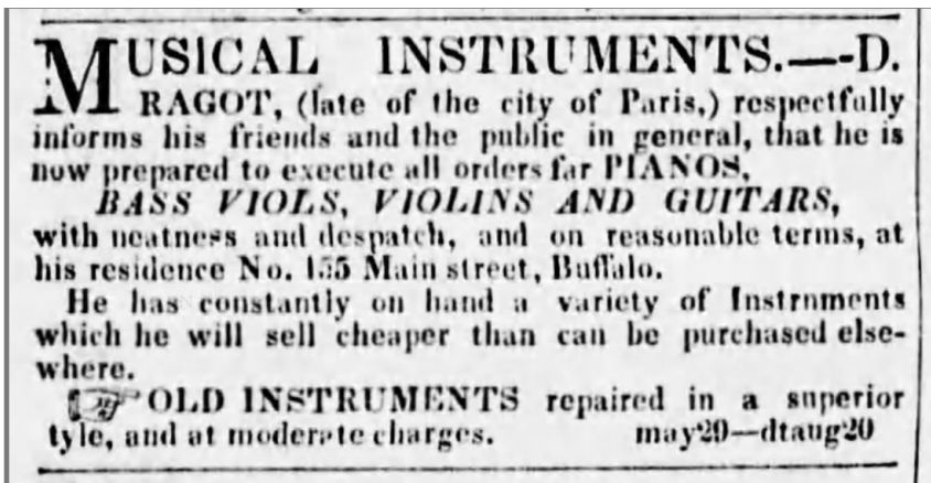
Figure 3: Advertisement, Buffalo Daily Gazette , May 29, 1843.