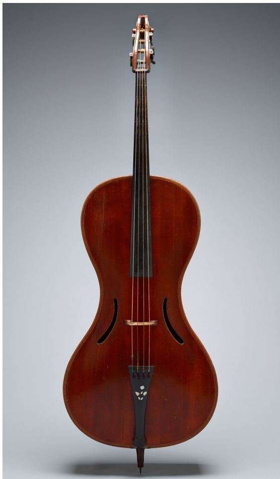
Figure 4: Violoncello, Morris Steinert Collection, Musical Instruments at Yale, New Haven, Connecticut.

at Yale, in New Haven, Connecticut (accession no. 4828.1993, fig. 4). An intact label by Ragot is adhered to the underside of the belly, with the same text and format as the label in the Getz violin described above. That label is amended at its bottom in a slightly different typeface (or perhaps carefully rendered using an ink pen) with: Buffalo, 1840 . A second printed label is also present on the interior