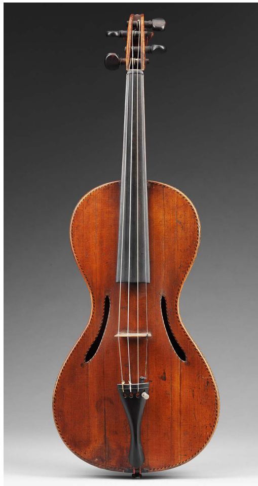
Figure 2: Violin, Smith College Music Department, Northampton, Massachusetts.