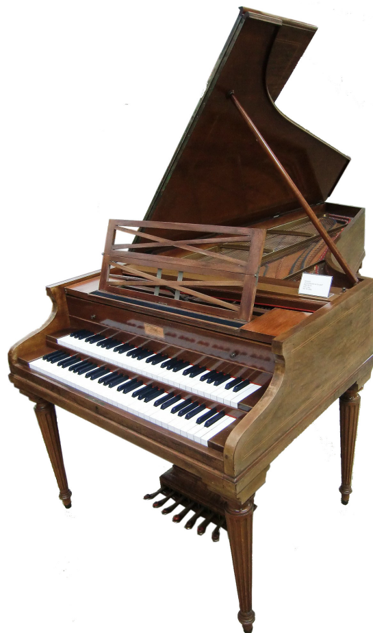
Figure 2: Landowska’s favored instrument, the Pleyel Grand Modèle de Concert (Paris 1927) - Berlin, Musikinstrumentenmuseum.

As Sibyl’s network of contacts in Connecticut grew, the Yale Collection began to occupy her attention. Formed in 1900 with a substantial donation of instruments from the piano dealer Morris