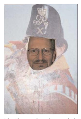
The Photographer, photographed