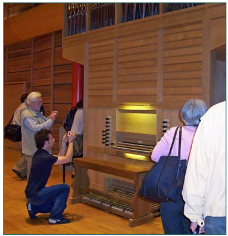
AMIS members get up close to the Ahrend organ at the University of Calgary

other sound-generating or recording devices. Among his requirements for an instrument: it should generate sounds in real