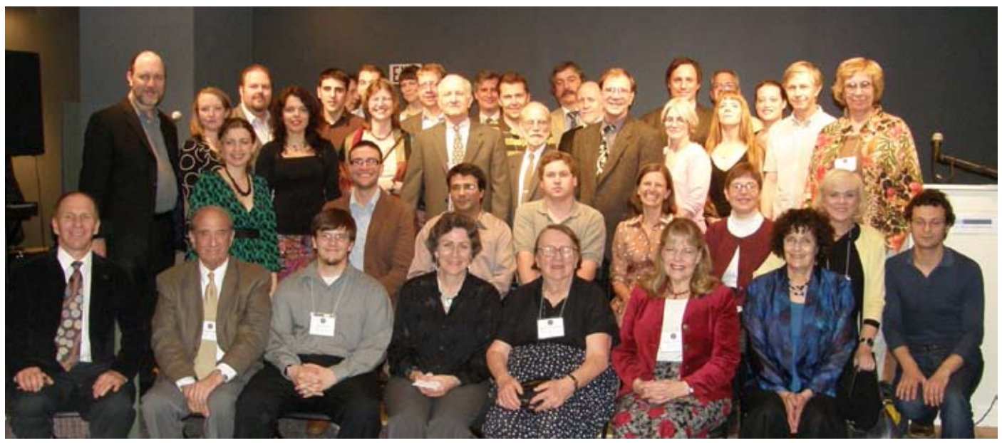
Group photo of Calgary attendees (A.H.)