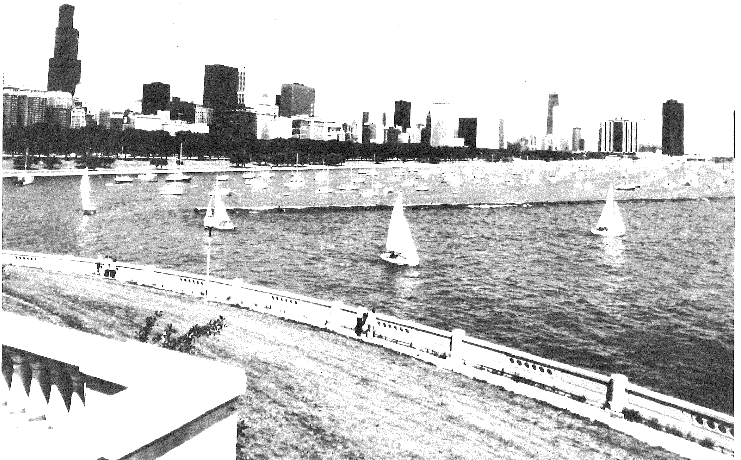
Largest fresh water port city in the world, Chicago boasts a magnificent skyline on one of the world's largest lakes, Lake Michigan. The tall building on the left is the Sears Tower, the world's highest.